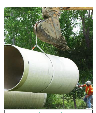
Partnership + Planning = Safety

For more information go to our website: www.enwin.com