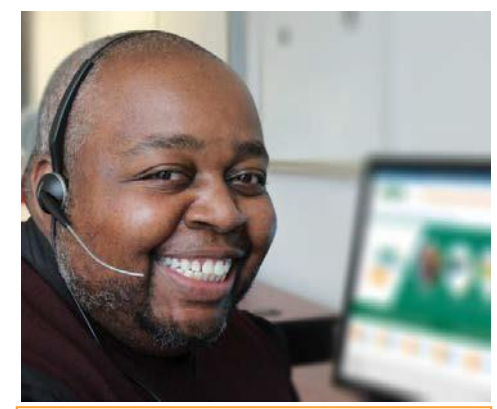
Call Centre + Local = Service

Our customer service employees work right here in Windsor, answering calls and providing the help and information customers need.